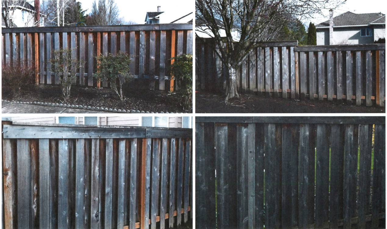
Figure B-1 – Approved fence installations illustrating acceptable materials, proportions, and natural weathering

These photographs depict existing fence installations that conform to the approved design and illustrate acceptable appearance, materials, proportions, and natural weathering.